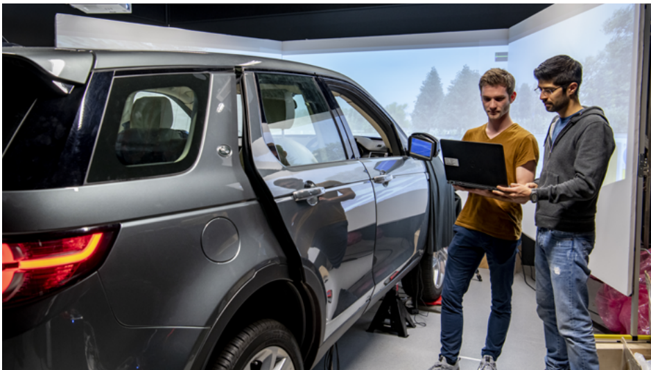
Above: Southampton University Driving Simulator laboratory (SUDDS), Boldrewood Campus.