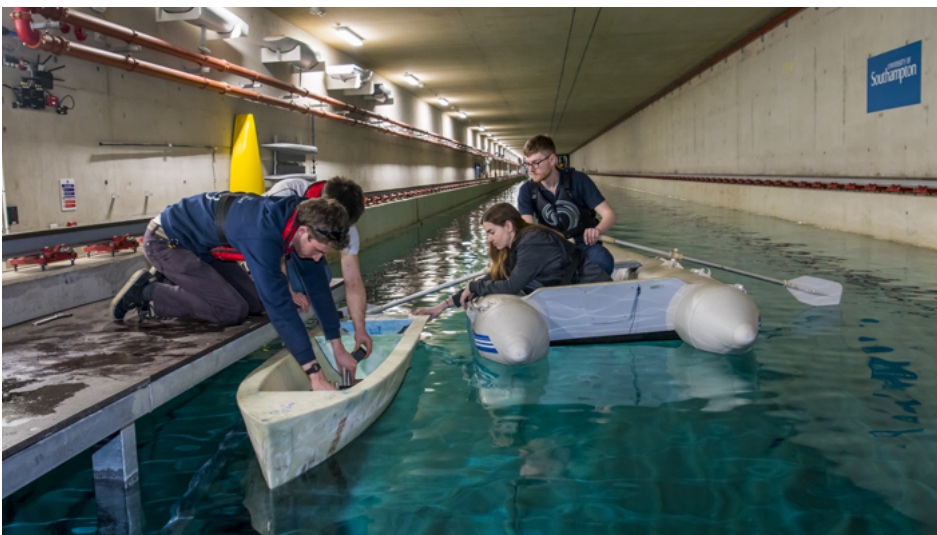
Above: 138m towing tank: Hydraulics Laboratory, Boldrewood Campus

The Faculty's specialist teaching and research laboratories and testing facilities, including one of the world's leading cleanroom complexes, are spread across the University's Highfield and Boldrewood Innovation Campuses. It is home to over 4,000 undergraduate students, over 600 postgraduate taught students, 1,030 postgraduate research students and over 880 education, research and enterprise staff. This represents an annual research income of around £60 million.